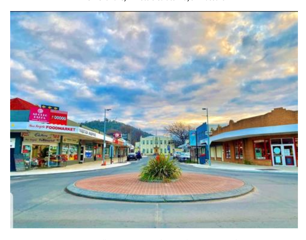
Derwent Valley Town Centre