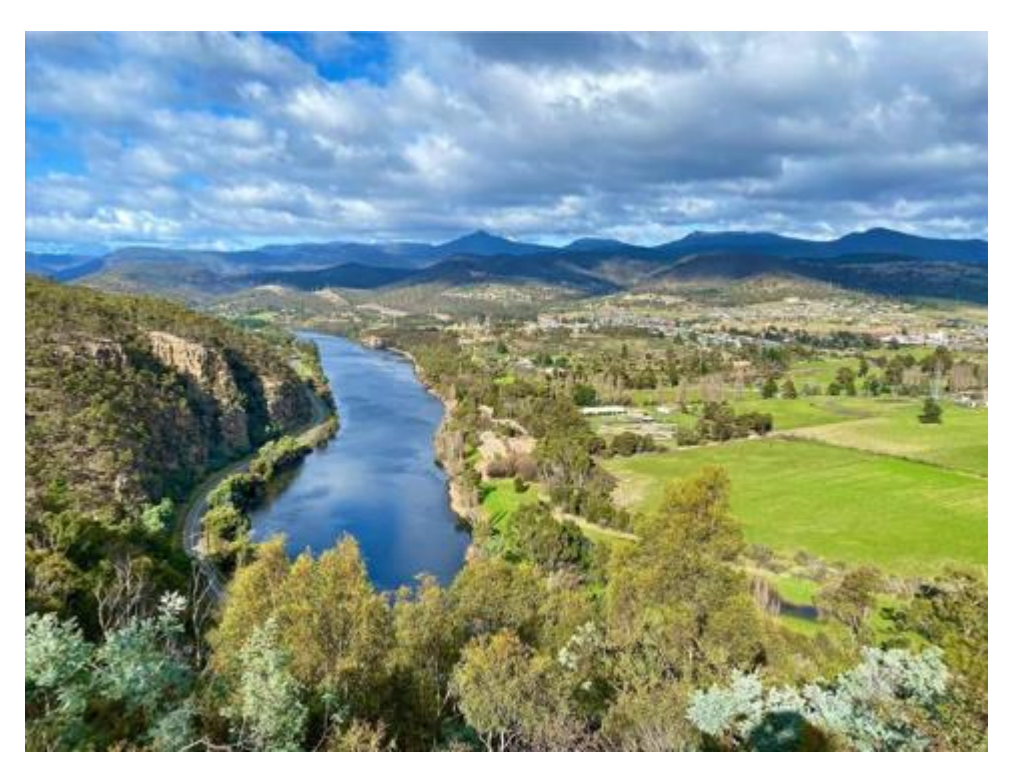
Derwent Valley

ORDINARY BOARD MEETING – 22 August 2022......3