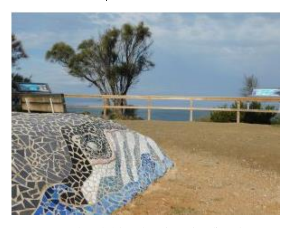
Spectacular Head Whale Watching