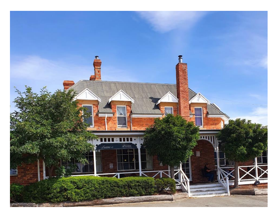
Dunalley Hotel

ORDINARY BOARD MEETING – 23 May 2022 ...... 3