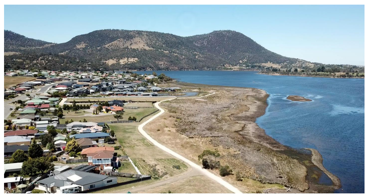
Old Beach Wetlands and foreshore walking track