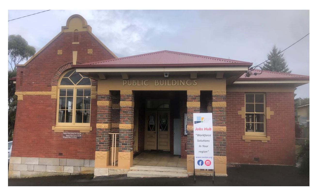
Old Council Chambers Pontville -New Jobs Hub. Photo Credit Anthony McConnon 2022